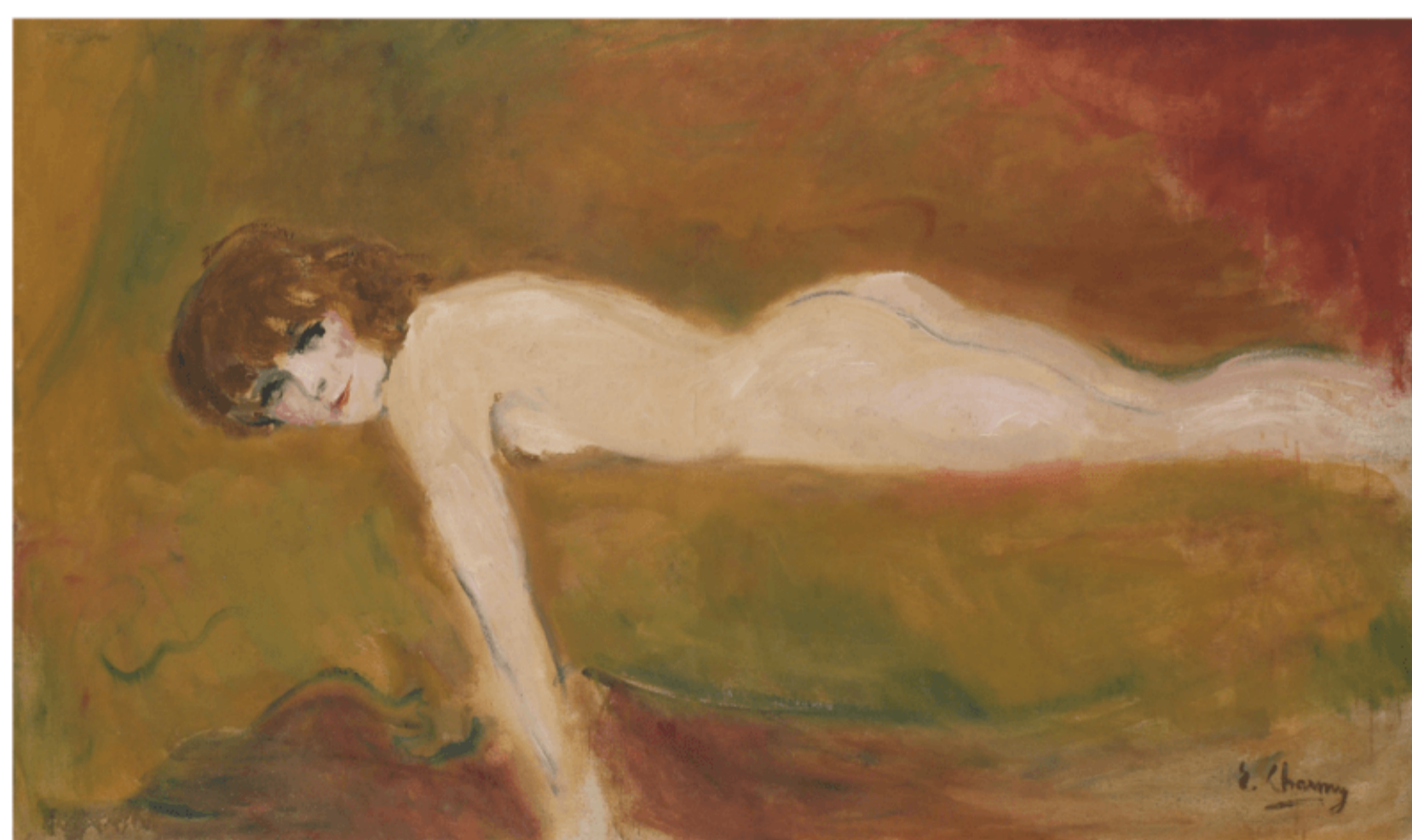
Emilie Charmy, Colette circa, 1920. Huile sur toile, 89 x 146 cm